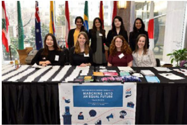
Global Women in Leadership Conference