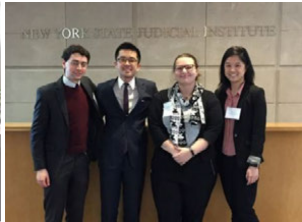
International Criminal Court Moot Team